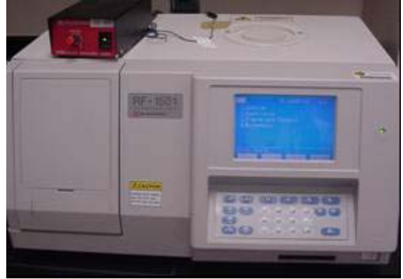
Shimadzu RF-1501 Spectrofluorimeter