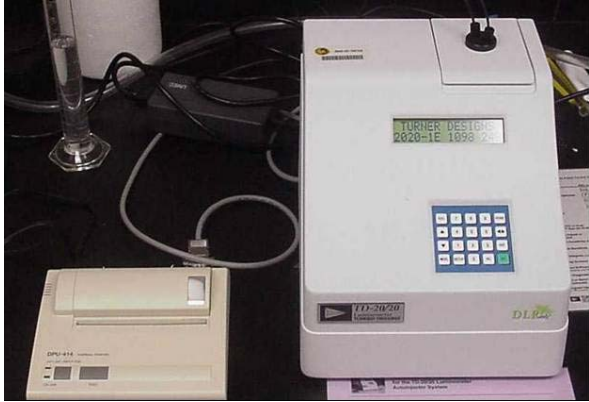
Turner Designs TD 20/20 Luminometer