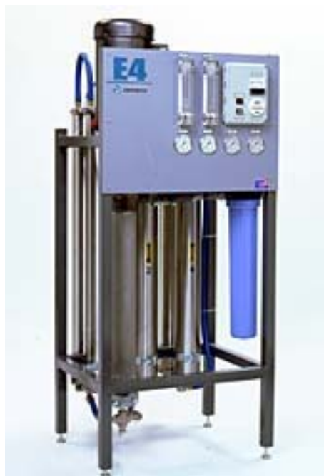
Osmonics E4-Single Element RO Test Unit

APPLICATION: Membrane assessment for determination of application toward removal of target contaminants from potential drinking water sources