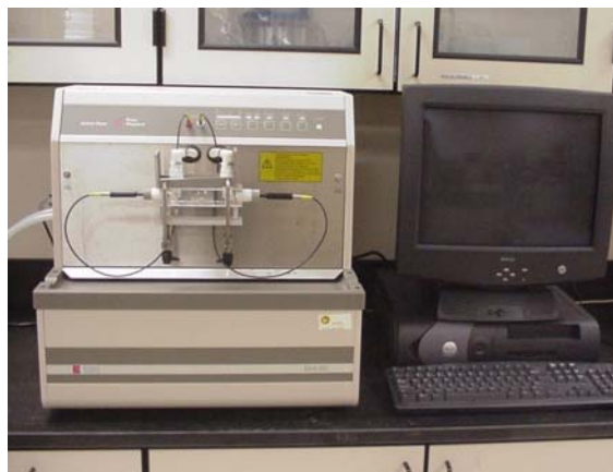
Anton-Paar Electrokinetic Analyzer