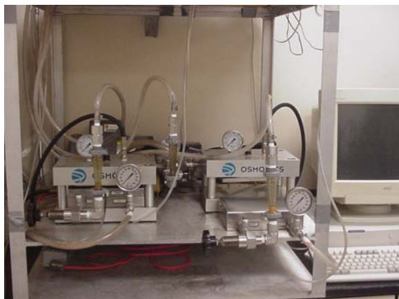
Osmonics Filtration Unit